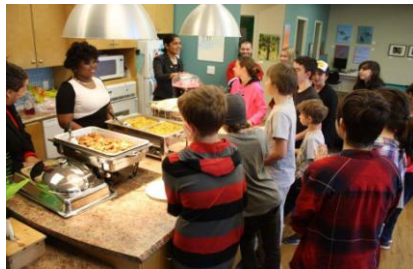
Staff teaches children about popular local dishes

The High Commission stands open to facilitate requests by students for information on Trinidad and Tobago. Research facilities at the Office of the High Commission include a reading room, an exhibition room, Carnival costumes and steelpanns.