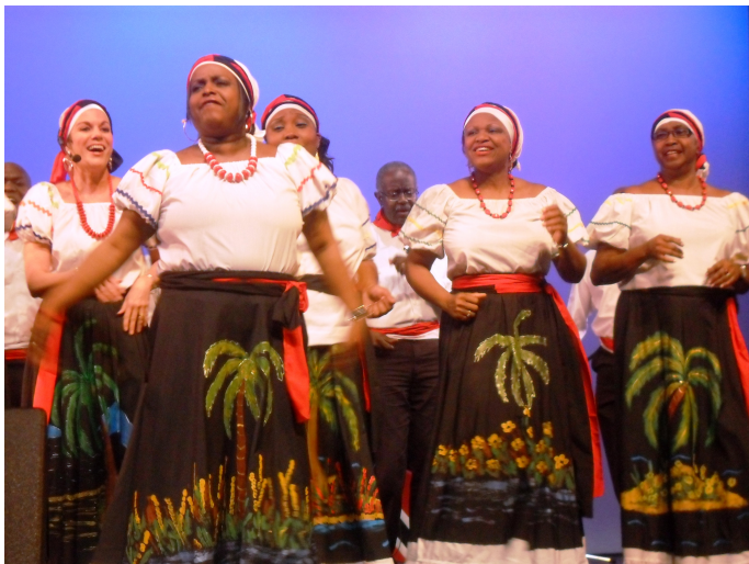
La Petite Musicale Troupe